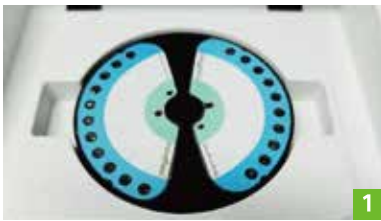
Put in the disk